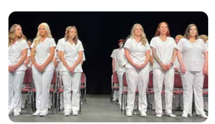
RVCC Nursing students are among the hardest working on campus and now, they're also being richly rewarded.

The $100,000 donation to the RVCC Foundation was announced last spring by the Community Foundation of New Jersey, on behalf of SHCHF. In addition to the 10 full scholarships—the first full scholarships in the Nursing program's history, an additional $25,000 was awarded by SHCHF to help offset textbook and Nursing program expenses for dozens of other Nursing students.