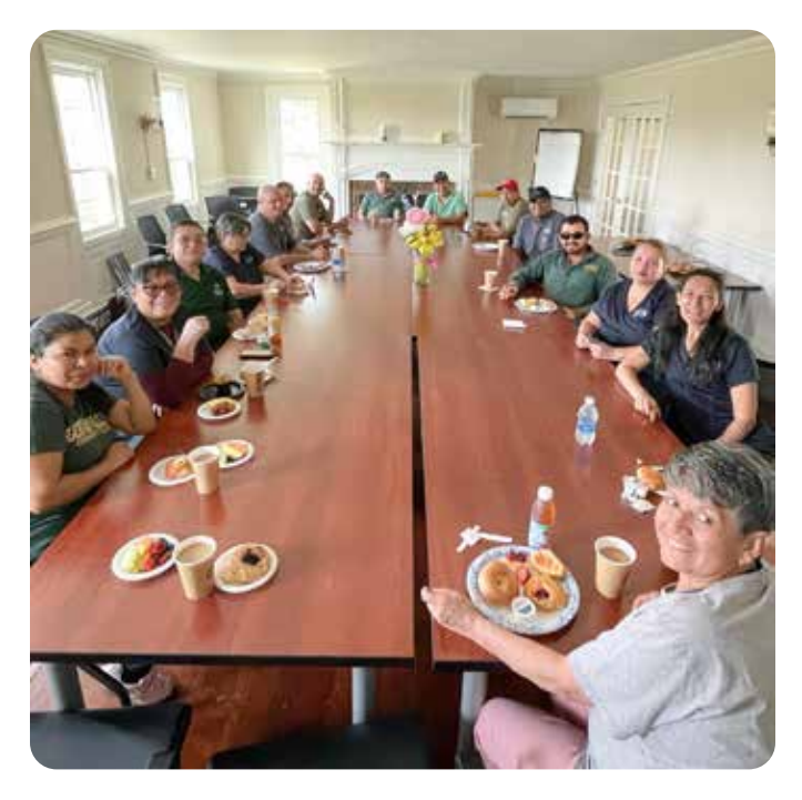
#rvccproud #gratitude #rvcchousekeeping #rvccgrounds #rvccfacilities #bestofnewjersey #raritanvalleycc #branchburgnj #74lamingtonroad

For our first "open house" at the RVCC Foundation's new digs (74 Lamington Road), there is simply no better first "guests" than those who care for the buildings and grounds—day-in and day-out—on the more than 250 acres of the Raritan Valley Community College campus. We love this committed, hard-working group—and we couldn't do what we do without them!