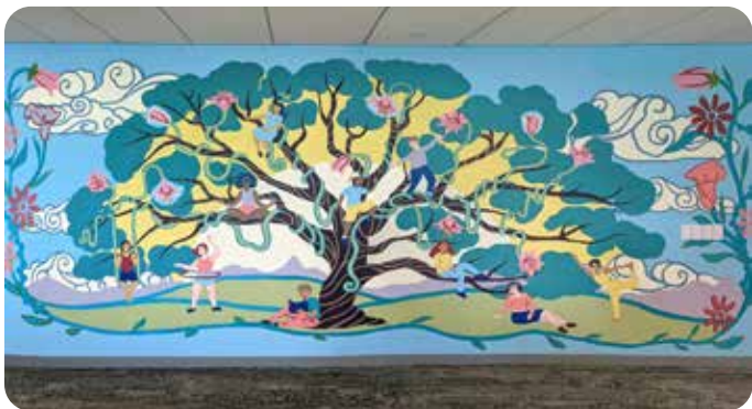
ABOVE: Brighter Lives, Better World: Mural on the wall at Signify, created by RVCC Arts & Design students

#bestofnewjersey #signify #rvccproud #raritanvalleycommunitycollege #rvccfacultyrock #rvccarts&design #rvccstudents