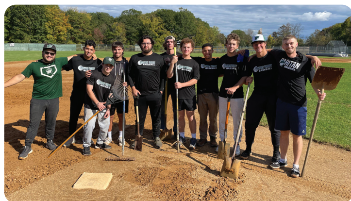
Top Left: Stars for a day Bottom Left: Participants gather at #34 Bottom Right: Putting a shine on the diamond