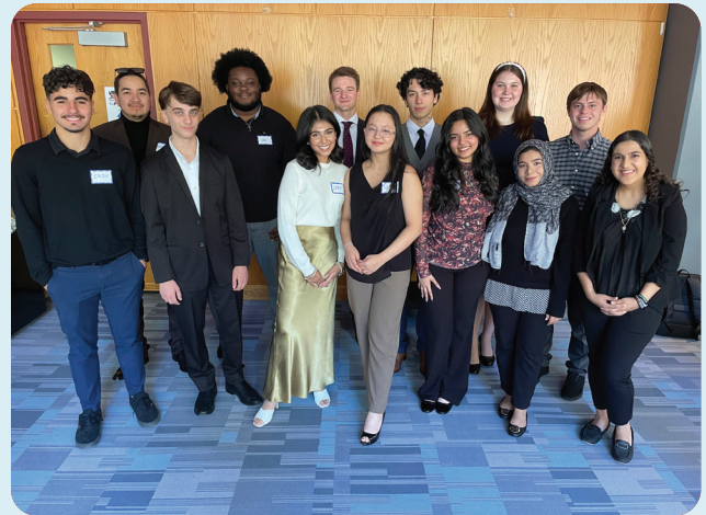
Pictured Above: RVCC mentee class for 2023-24