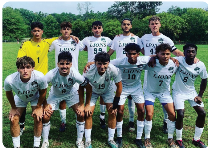
Starting 11 of the 2023 Men's Soccer Team

MEN'S SOCCER: The team finished as Region XIX finalist with a 9-3-4 record! While the Lions playoff run ended too soon, with a loss to #7 ranked Camden County College in the Regional Championship, they brought plenty of joy to their loyal fans this season!