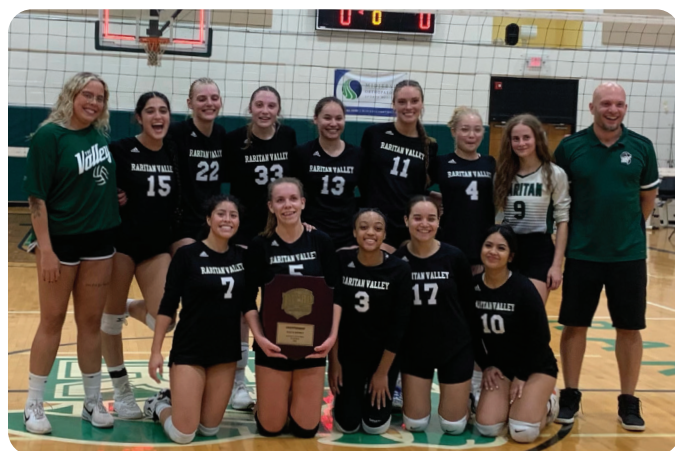
2023 Women's Volleyball Team

WOMEN'S VOLLEYBALL: The 29-5 East District B Champion Lady Lions punched their ticket to the NJCAA Division III National Championship Tournament in Cedar Rapids, Iowa. Though the team ultimately lost to #2 overall seed Owens Community College (from Toledo, OH), they had another epic season!! Congrats to entire Women's Volleyball squad and thanks for all the GREAT you brought to the 2023 season!