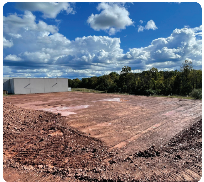
Ready to build

More on this developing story as it progresses toward a late 2024 opening.